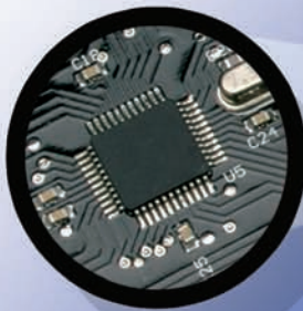
Soft-Stop / Soft-Start with intelligent Obstruction Detection