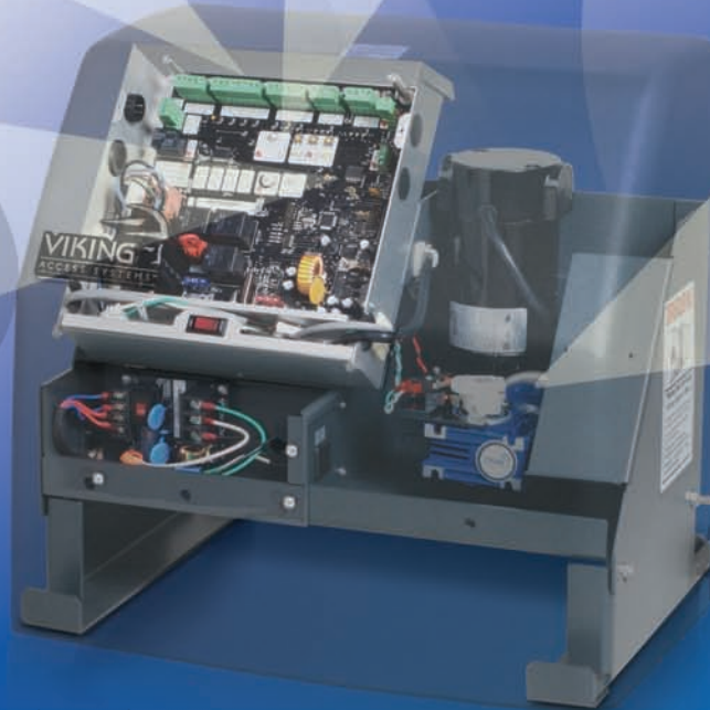
120 / 220 VAC single phase power source