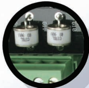
On-board lightning protection

The K-2™ slide gate operator raises the bar in quality for the residential market. This machine operates a highly efficient direct motor drive which allows operation at 100% duty cycle. This assures efficiency and reliability. The fail-safe, fail-secure options of the K-2™ gate operator allows it to handle gates up to 650 lbs. in conformance with UL 325 and UL 991 Type I, III and IV. This operator is UL Listed 18TC UL325 and UL991.