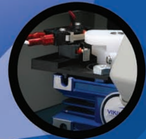
Easy access to limit switch